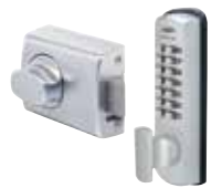
002DX Keyless Deadlatch