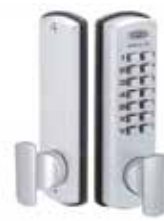
530DX Keyless Entrance Set