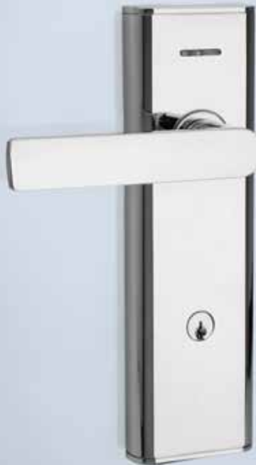
Vision Plate with Spire L3 Lever, Chrome Plate